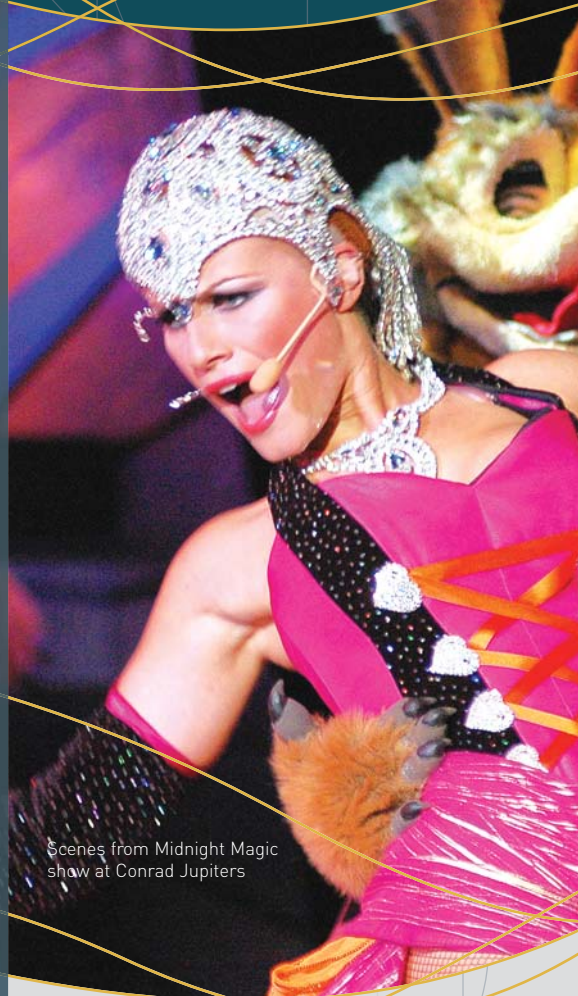
Scenes from Midnight Magic show at Conrad Jupiters

Our mission is to assist the Australian casino industry in providing the highest quality entertainment and gambling facilities and to assist the casino industry in its development as one that is both economically sustainable and socially responsible.